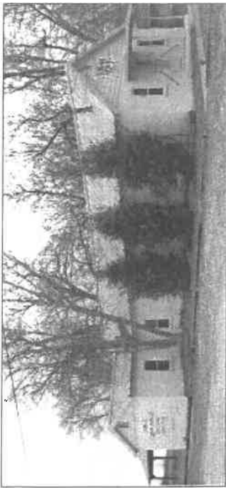
Goshen Community Building.

tending all-day festivals which included a picnic, baseball games, and a roped off arena for boxing matches. 5